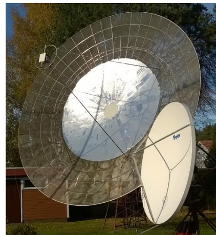
Secret behind OH2DG's BIG signal