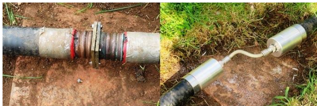
G3LTF's cable repair

on 13 cm SV5/HB9COG for initial #152 and DXCC 49; on 30 Sept on 9 cm SV5/HB9COG for initial #76 and DXCC 31. Sadly, when the SV5 team were on 6 cm, it was far too windy to even undo the dish. I did work on 30 Sept on 23 cm KB7Q for initial #507 in WY; and on 4 Oct on 23 cm SV5/HB9COG #508 and DXCC 80 followed by CT1BYM #509. Thanks Dan and Sam, some excellent operating and the equipment working perfectly to be able to work on CW with a 1.5 m dish. On 1 Oct, I spent a lot of time trying to work KB7Q in NB, but could not keep my dish on the Moon due to strong winds blowing across and into it. Slippage was occurring in the HA axis of about +/- 10 degs (my -3 dB BW is 8 degrees) and to work a single yagi station, everything has to be spot on. Gene was very patient and he did copy me at one point with (429). I have worked his station with the same set up before, so it is possible. Thanks again Gene! In the last few days, I believe I have now found and removed the slippage. During the month, I replaced a joint in a 50 m run of 1 5/8" heliax with a pair of connectors and a short cable. The loss is unchanged at 2.4 dB, but the VSWR is better.