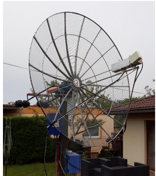
OM4XA's 3 m dish used with 50 W on 1296