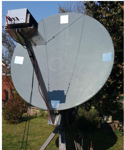
F5HRY's offset dish used with 18 W on 6 cm

▶ Please keep the reports coming. We do not expect activity to slowdown in Oct with the ARRL Microwave Contest on 23/24 Oct. Look for K2UYH. We both will be looking for you off the Moon. 73, AI – K2UYH and Matej – OK1TEH.