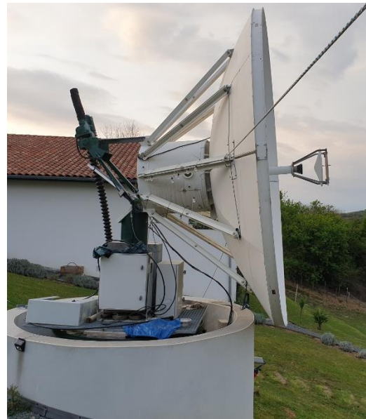
F2CT's 3 cm dish used in ARI Contest

reassembled our 1.2 m dish with 70 W 10 GHz station just in time for the SV5/HB9COG dxpedition. The day before the dxpedition, on 2 Oct we worked DF2GB while testing out the system. We needed to use Q65-120E for this QSO, since we could not decode Gun with our small station using -60D. The next day, we worked SV5/HB9COG followed by OK1KIR, OZ1FF, OZ1LPR, PA0BAT, DL7YC, OK1DFC, OK2AQ, K2UYH and G4RFR. G4KGC (Petra) was also QRV and worked SV5/HB9COG , DL7YC and OK1KIR. We were QRV again on 8 Oct, and worked CT1BYM, F6BKB, and WA3RGQ. [see info on getting more from Q65 at end of this NL].