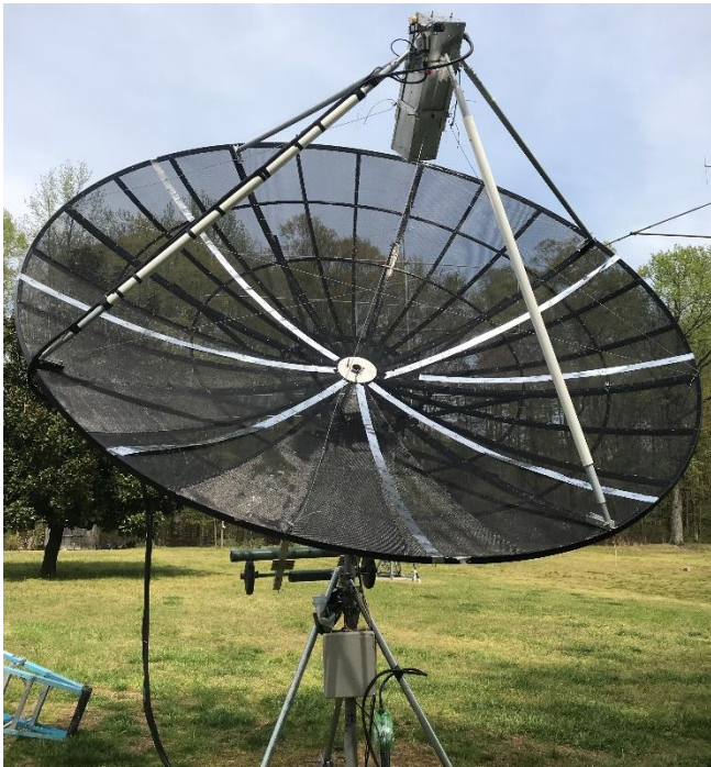
WA3QXP's 12' dish with 1296 feed located in DE

WA3QXP: Paul wa3qpx@atlanticbb.net wants folks to know that he is alive and QRV on 1296 EME from DE – Just email me if you want a sked. I will also be on in Nov for the ARRL EME Contest and especially looking for stations needing Delaware. I will be checking the HB9Q logger during the contest. My station is a 12' TVRO dish, KL6M feed with 300 W at feed using DEMI's latest XVTR to a Flex 6300. I have no current plans bands above 1296.