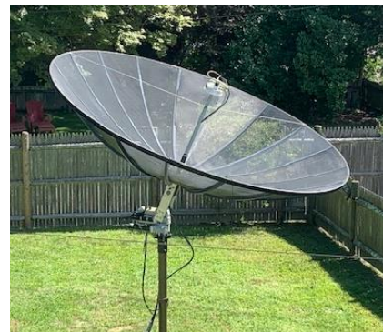
W3CJK's 3 m dish with W2HRO patch feed

W3CJK: Bill n46jenny@gmail.com in RI is very pleased with his new dish for 1296 -- I rescued a 3 m former SAT TVRO dish. It was missing 3 panels, needed much work. It is now operational on 23 cm. I am using a Slew drive and patch feed from W2HRO, a G4DDK VLNA at feed, an ICOM 9700 to BEKO HLV 350. It seems to perform well. TX7EME and SV5/HB9COG .