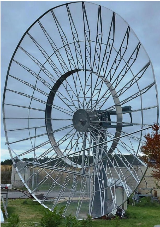
OK1DFC's new 8 m offset dish

everything completed by the ARRL MW Contest. I would like to be QRV on 13 cm on all sub-bands. I was QRV for a while in the ARI contest and gave out a several points. During the SV5/HB9COG dxpedition I worked them on all bands except 13 cm, where I had interference. I now knew where it was coming from but the dxpedition is over. I worked in the ARI Contest on 23 cm using Q65C unless noted DL4DTU, UA9FAD, PA3FXB, OM4XA, IK2DDR, OK1KIR, UA9FAD (DUP), IK3COJ, OK1UGA, OK1KIR CW, IK1FJI CW, SP7DCS CW, G4EZP JT65C, RA3EME JT65C, DF2VJ JT65C, DG0FE JT65C and for digital initial {#430}, IK7EZN JT65C, N5FB JT65C, I7FNW JT65C, G3LTF CW, SM5DGX CW, KB7Q {#431} and N0CTR {#432}, KB2SA, IK2DDR CW for initial #452, SV5/HB9COG {#433} and CT1BYM {#434} for a total of 27 contacts; on 3400 using Q65C unless noted SV5/HB9COG for digital initial {#21} and DXCC 24; on 6 cm SV5/HB9COG using Q65D for digital initial {#28} and on CW for initial #44; and on 3 cm using Q65D SV5/HB9COG for digital initial {#35} and DXCC 69 and DL3WDG {#70}, and back on 23 cm CT1BYM Q65C {#434}. More info on my new dish can be found at 8m_offset (ok1dfc.com) .