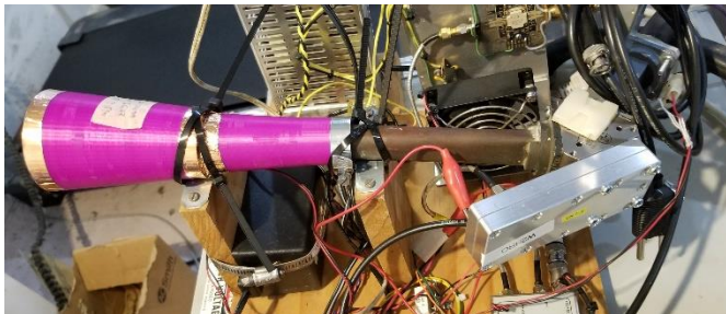
K2UYH 3D printed 3 cm feed mounted for test

NET/CHAT/LOGGER NEWS: HB9BBD was QRV on 3 cm for the ARI Contest and is looking forward to coming activity weekends. N1AV is QRV on 902 with his 2.4 m dish and 350 W. Jay plans to be QRV for the 902 activity weekends. Plans HI dxpedition are for Feb on 1296 and 902. N8DJB/4 is QRV on 902 with a 5.6 m dish and up to 600 W from his SSPA. If interested in skeds contact Craig at n8djb@coastalwave.net . KL6M tried to be QRV for the 902 AW but had power supply troubles and never did get power output. I copied PY2BS very well with quality good enough for JT or CW. PY2BS also had a PA failure, but worked VE6TA (18DB) before losing his SSPA. He also copied K5DOG (23DB) later. Bruce should be QRV on 902 again soon.