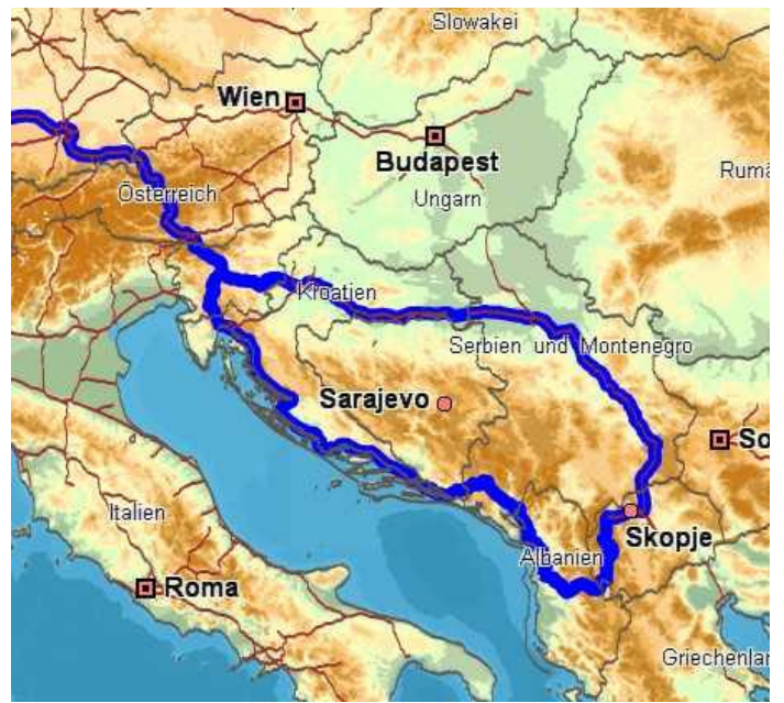
Route DL3OCH's Grand Tour 1296 JT EME Dxpedition

difficult in Albania. A local ham helped me get a license, but it still took several days. 1296 operation was not allowed in ZA, but many things have changed and I was able to obtain a license. All skeds were successful in ZA and QSOs made with DJ9YW, G4CCH - very weak, OE9ERC - usual (22 dB), HB9Q followed Erich, OH2DG - used wrong format for calls and K2UYH - (-23 dB). Our final location was in Bosnia. Everything there looked so clean and modern compared to Albania. The landscape is beautiful. We found a house used for scouts up on a mountain. I did almost as well from Bosnia as Albania. There was an absolutely clear sky and the moon was very nicely visible. It was almost perfect for EME. I QSO'd G4CCH - easiest even though only (-28 dB), DJ9YW, OE9ERC - strong as usual, HB9Q - very weak but nice decoding and K2UYH my longest JT65 QSO ever (73 minutes) with very weak signals in the beginning that became much stronger (-23 dB) at the end. I only missed with OH2DG. At first I could not decode him. Later when I was decoding him (-25 dB), Eino did not seem to hear me. More information about my trip should be added to my website www.dl3och.de soon. I plan to published an article on the trip in DUBUS magazine. Many thanks to Heinrich for his support and help during the trip. Please contact me, if you are QRV on JT65 on 23 cm and would like to QSO me on one of my further Dxpeditions.