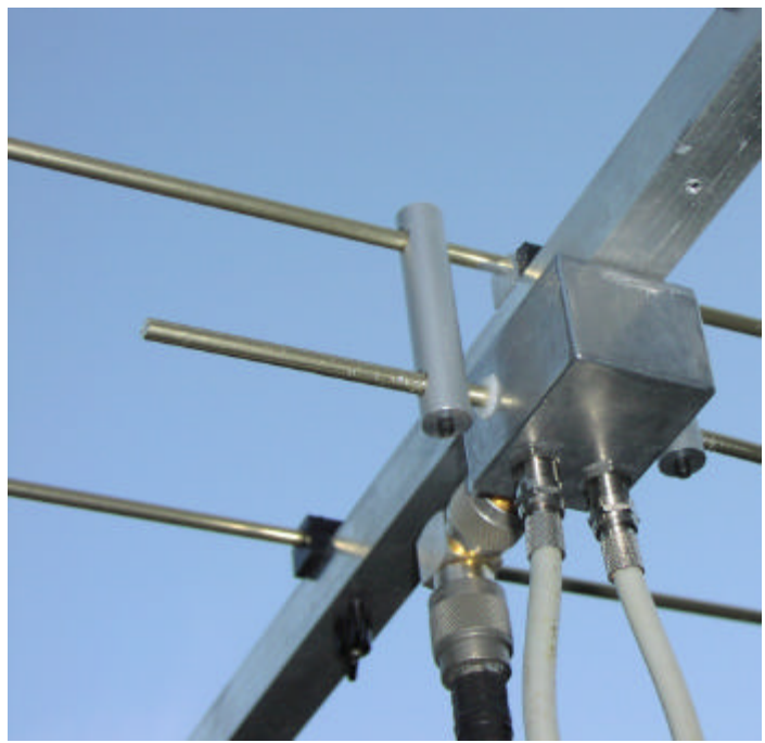
PA0PLY's Double T-match

TECHNICAL: PAOPLY's Double T-match - Since the performance of my EME antennas became remarkable poorer over time, I decided to investigate the reason for this degradation.