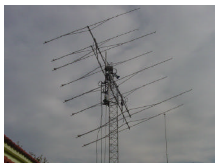
SV1BTR 8 x 39 el 13 wl yagi array used to complete WAC

VE6TA: Grant ve6ta@telusplanet.net sends his 70 cm contest results — Not much success to report on this last leg of the EU contest. I found poor conditions with lots of polarity smearing and the distraction of the ARRL June VHF Contest created lots of problems. I had expected there would be more NA stations on exchanging grid squares, but this was not the case. I did not even hear my own echoes until the last 3 hours of the contest. However I managed to work 13 stations and heard a few stations that I need to schedule, so all is not lost. The following stations were worked: JA6AHB, K5JL, K0RZ, VK3UM, KL6M, DL9KR, F6KHM, OZ4MM, SV1BTR, HB9Q, K1FO, SM2CEW and G3LTF. I also heard DL7APV, DL7UDA, EA3DXU, F2TU and S52CW. An SP station called me a few times, but could not get the full call due to the libration.