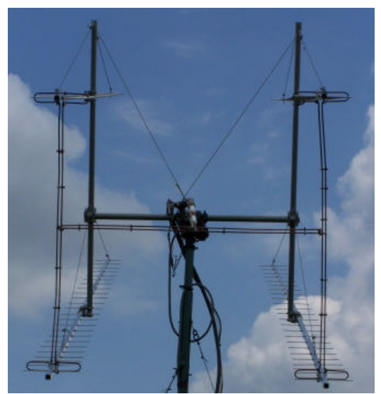
SP7DCS's 4 x 25 el I0JXX yagis with open wire feed system

SP7DCS: Chris sp7dcs@wp.plwas was active on 432 for the EWW Contest and writes – I wanted to try 70 cm EME for many years and I decided to build a small system to try this band. My goal was to be ready before EU EME contest. I completed the antenna, 4 x 25 el I0JXX yagis with open wire feed system, but still did not have a good RX and TX capability. Just before contest I managed to modify a very old preamp and to put it at the antenna. This preamp has very high NF and low gain, but it was better then nothing. I also used 20 years old RX and TX. I did not manage to make any QSOs as I had only 50 W in the shack. Anyway it was great fun to hear my first 70 cm EME signals. It even more satisfying to know I heard theses signals under bad conditions. I copied HB9Q, SV1BTR, OZ4MM, DL9KR, F6KHM, K1FO, VK3UM, K0RZ, K5JL and F2TU?. My activity is only on random CW. I do hope to have better RX and more power in the future and to make my first QSO soon.