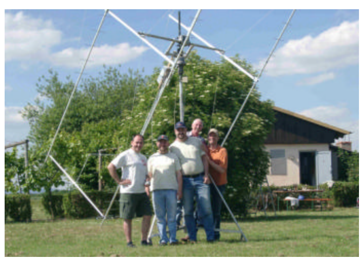
DL0GER crew in front of their 4 x 8.5 wl yagi array

encourage people to go this way. Good one, Leif! Thanks a lot for your engagement. In the contest we were QRV after 1800 on Friday, after building up the station in about 5 hours and w heard quite nice echoes at moonset. However conditions seemed poor and did not improve during the contest. It was clearly seen that one is wasting a lot of time when using fixed polarity. The stations with rotatable arrays or feeds were at their "normal" signal strengths, while the "horizontal" ones (even DL9KR!) were way down. We worked 12 stations in the contest and W7AMI (4Y) on sked. QSO'd were KL6M, VK3UM, VK4AFL, OZ4MM, HB9Q, F6KHM, K1FO, K5GW, JA6AHB, F2TU (loud but drifting), G3LTF and DL9KR. Heard were SV1BTR (called for ages), OZ6OL, K0RZ, N9AB and JA9BOH, VK3UM was at 20 dB above noise, also F6KHM and HB9Q. Nice signals from G3LTF and VK4AFL. We had a webcam running and I am sure some of you had a look. Some might be bored on watching 2 beer drinking guys playing radio, but I guess sometimes it is nice to see the person and the setup at the other end. The DSL connection went dead early on Sunday morning for some unknown reason. Besides the poor conditions, we spent a really nice weekend in the vinevards where our OTH is located. The crew was DL2IAN, Tom (OP), DJ2ANG, Dave (WLAN), DD8IL, Andi + XYL (Webcam) DJ1UO, Elmar (mental support). Our website at http://dl0gereme.dd8il.de/ will be updated soon for Pixs and sound. I promise we will be