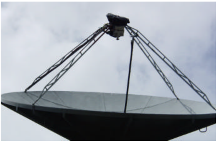
OK1KIR's dish with the 6 cm feed in pl ace

OK1CA: Franta ok1ca@ges.cz sends his 432 DUBUS Contest report-- I return on 70 cm after ten years for the June contest weekend. I install feed for 70 cm in 10 m dish with Cassegrain System. It is 9 el yagi with rotary polarization, but not optimally adjusted. I employed my old G17b PA with only around 250 W. I was ready on Saturday only a few hours before the start of the contest. I worked on 11 June VK3UM, HB9Q for initial #122, F6KHM #123, F2TU, K5JL #124, K1FO, OZ4MM #125, SV1BTR #126, KL6M #127 and K0RZ. I CWNR SP6JLW and I heard DL7UDA, DL0GER and DL9KR. I think condx were bad. I QSO'd most EU stations with vertical polarization and W stations with horizontal pol.